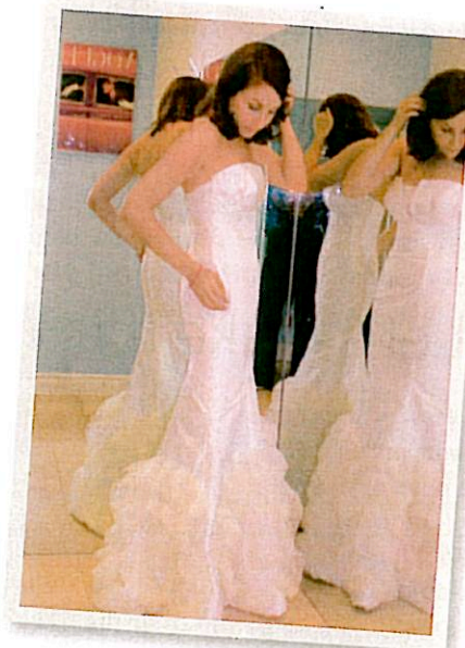
Perfectly in shape at her final fitting.